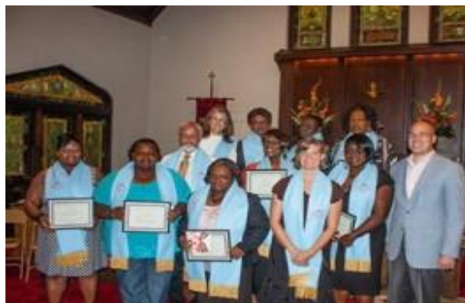
Starkville Bridges Third Getting Ahead in a Just Gettin' by World Class Graduation