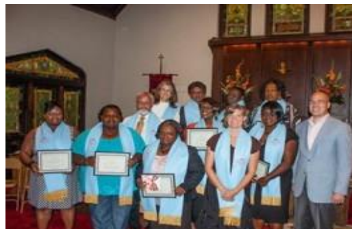
Starkville Bridges Third Getting Ahead in a Just Gettin' by World Class Graduation