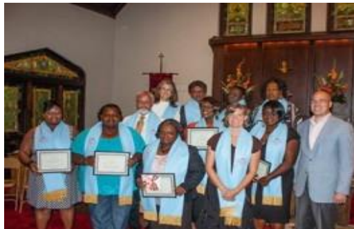
Starkville Bridges Third Getting Ahead in a Just Gettin' by World Class Graduation